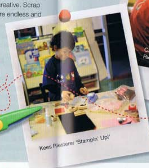
Kees Riesterer 'Stampin' Up!